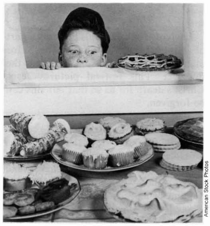
Before the Days of Unleavened Bread, all foods with leavening must be put out of the house.

The third spring festival is the Day of Pentecost. It shows us how God is calling only a few people to understand His truth now. The vast majority of mankind will be called to understand later!