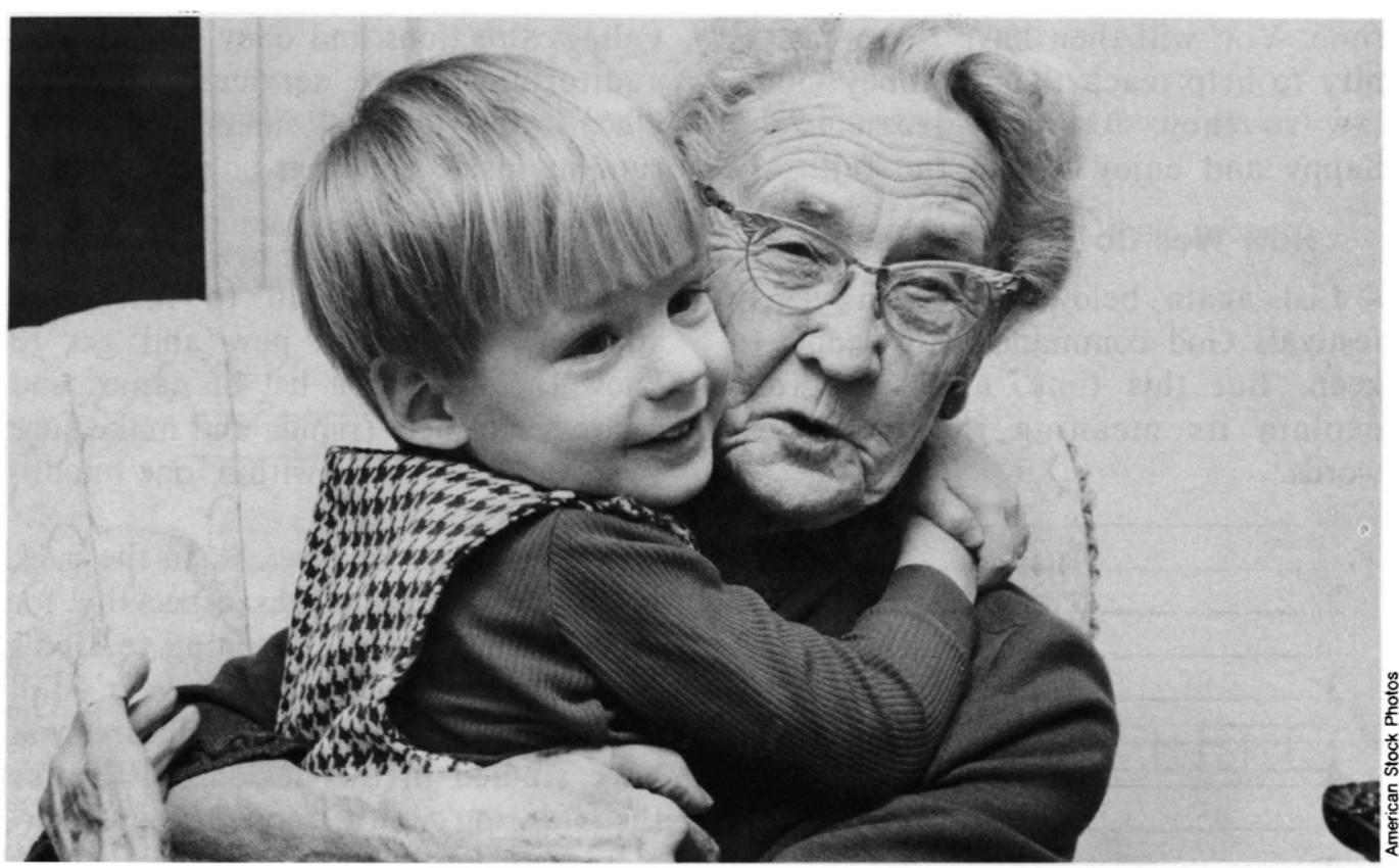
After the Millennium, you will be able to help show God's way of life to those who have never known God's truth. You might even be teaching some of your own relatives!

of human beings who have ever lived have had an opportunity to become a part of the God Family by being born into it as spirit beings. The great majority of humans are still dead at this time, never having known the truth of God. That brings us to the "Last Great Day"—the final step in God's master plan for mankind!