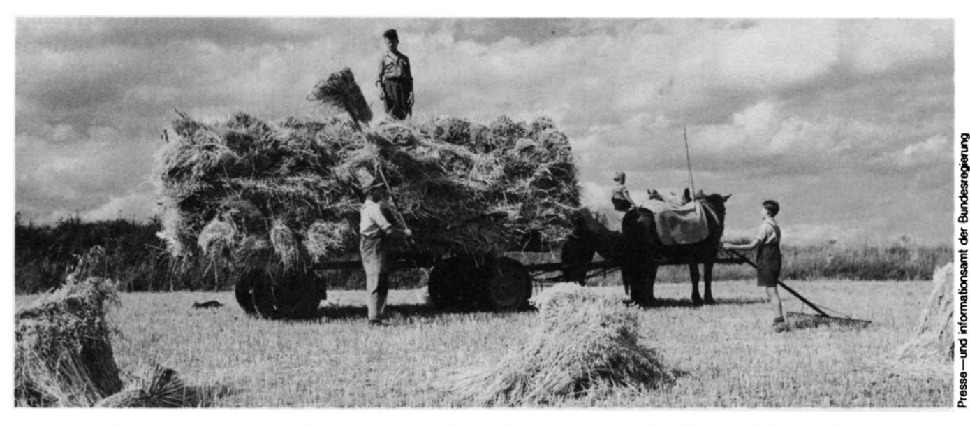
Pentecost comes at the time of the spring harvest. This festival pictures the "first fruits"—the first spiritual "harvest of people"—in God's plan.

The Feast of Trumpets is a joyful day because it pictures a happy new beginning under God's government. But before God's government can make this